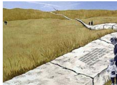
"Disturbed Harmony," one of five finalists' designs for a memorial for the Flight 93 crash site in Somerset County, features a stone wall that would guide visitors to the impact area and become a memorial wall and a timeline of events from the 9/11 crash.

The journey from Pittsburgh to the United Flight 93 crash site in Somerset County is a process of elimination. First the city falls away, then the hair-raising Pennsylvania Turnpike gives way to stop-and-go Route 30, then Lambertsville Road to snow-swept Skyline Road. We pass from urban to suburban to rural farm to remote field and then, as we near the crest of the ridge on Skyline Road, something in the field to the right catches the corner of an eye. What is that tangled pile of red, white, blue and black metal?