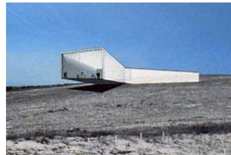
"Memory Trail," one of the finalists' designs for the Flight 93 memorial, follows the plane's flight path as it approached the field in Somerset County.

The entrance will be on Route 30, with some land north of that road also included as part of the entrance experience. The guidelines organized the irregularly shaped park area into five regions: the gateway, the approach, the ridge, the bowl and the sacred ground, which includes the crash site and adjacent hemlock grove. Trees shorn off by the impact have been removed and grass and wildflowers planted in the fields.